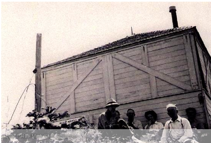
July 1949

1934: A 14 x 14 L-4 lookout house constructed and staffed by three CCC men.