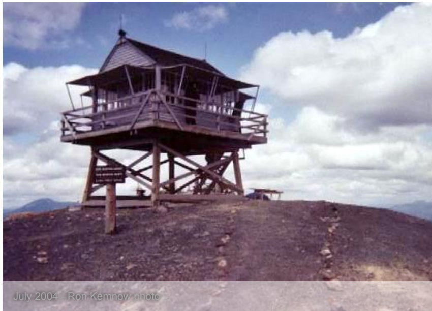
July 2004