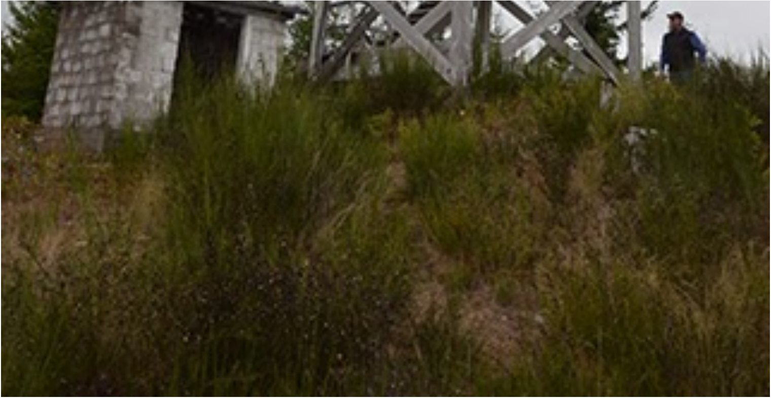
Cougar Pass Fire Lookout on October 10, 2018