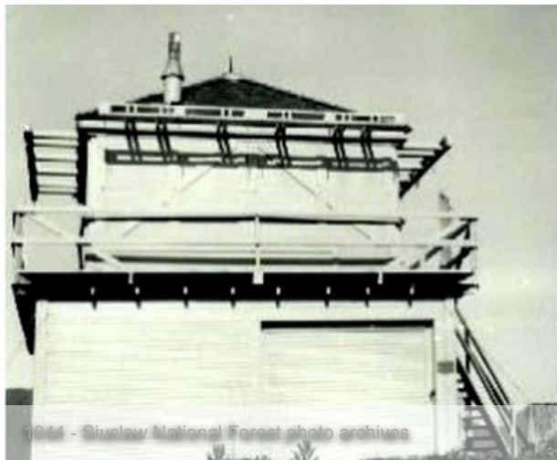
1944 - Siuslaw National Forest photo archives