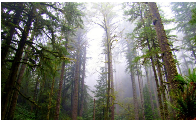
Firs in Oregon's Elliot State Forest.

generate revenue for the Common School Fund in Oregon.