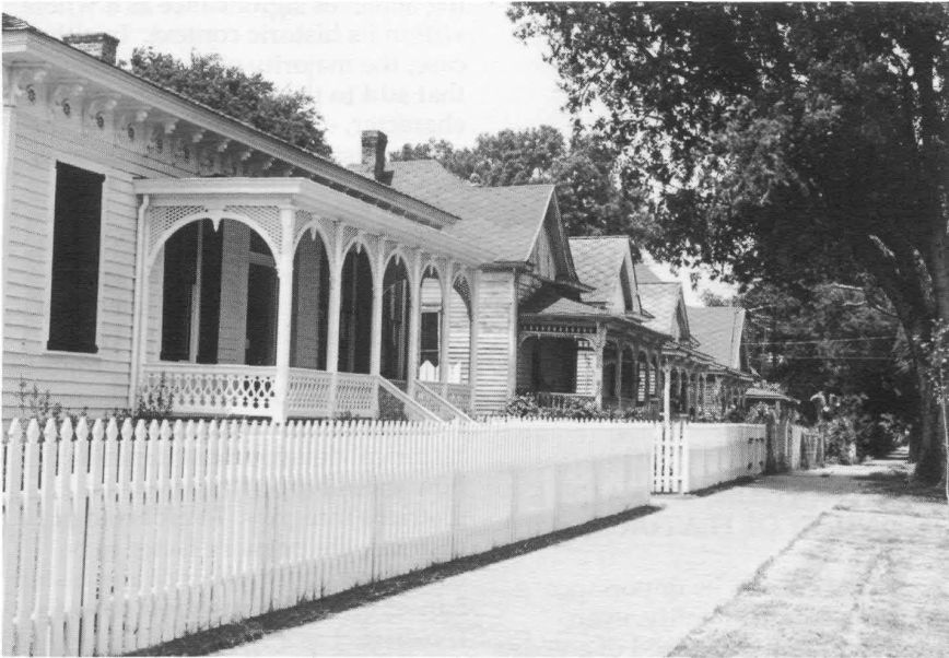
Ordeman-Shaw Historic District, Montgomery, Montgomery County, Alabama. Historic districts derive their identity from the interrelationship of their resources. Part of the defining characteristics of this 19th century residential district in Montgomery, Alabama, is found in the rhythmic pattern of the rows of decorative porches. (Frank L. Thiermonge, III)

business districts canal systems groups of habitation sites college campuses estates and farms with large acreage/ numerous properties industrial complexes irrigation systems residential areas rural villages transportation networks rural historic districts