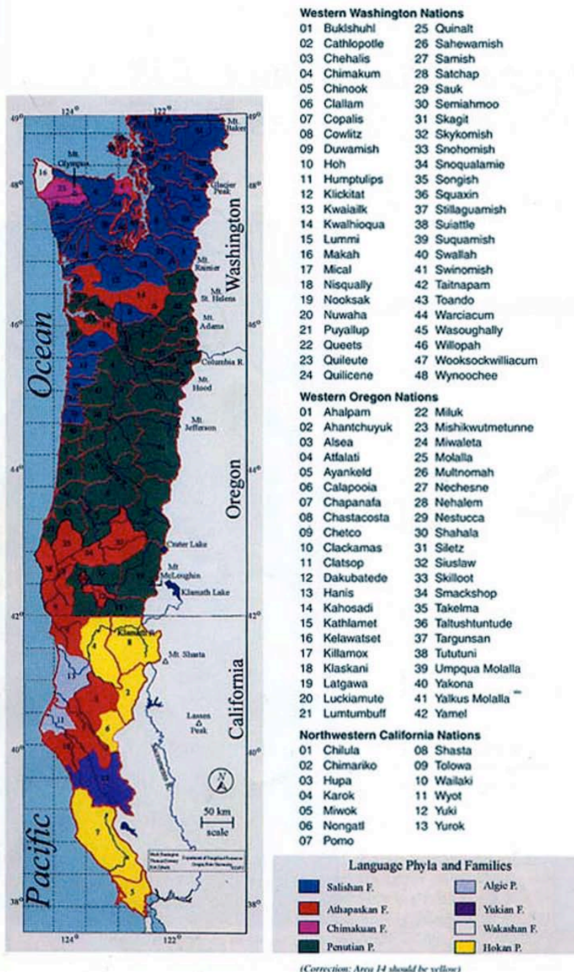
Figure 1. Indian nations of the Douglas-fir region, circa 1788.

aries are those established between competing settlements and families to control local resources. Currently in the United States, important political boundaries include public and private land-ownership patterns, city limits, voting districts, school districts, county lines, and state borders. In 1788, primary political bound-