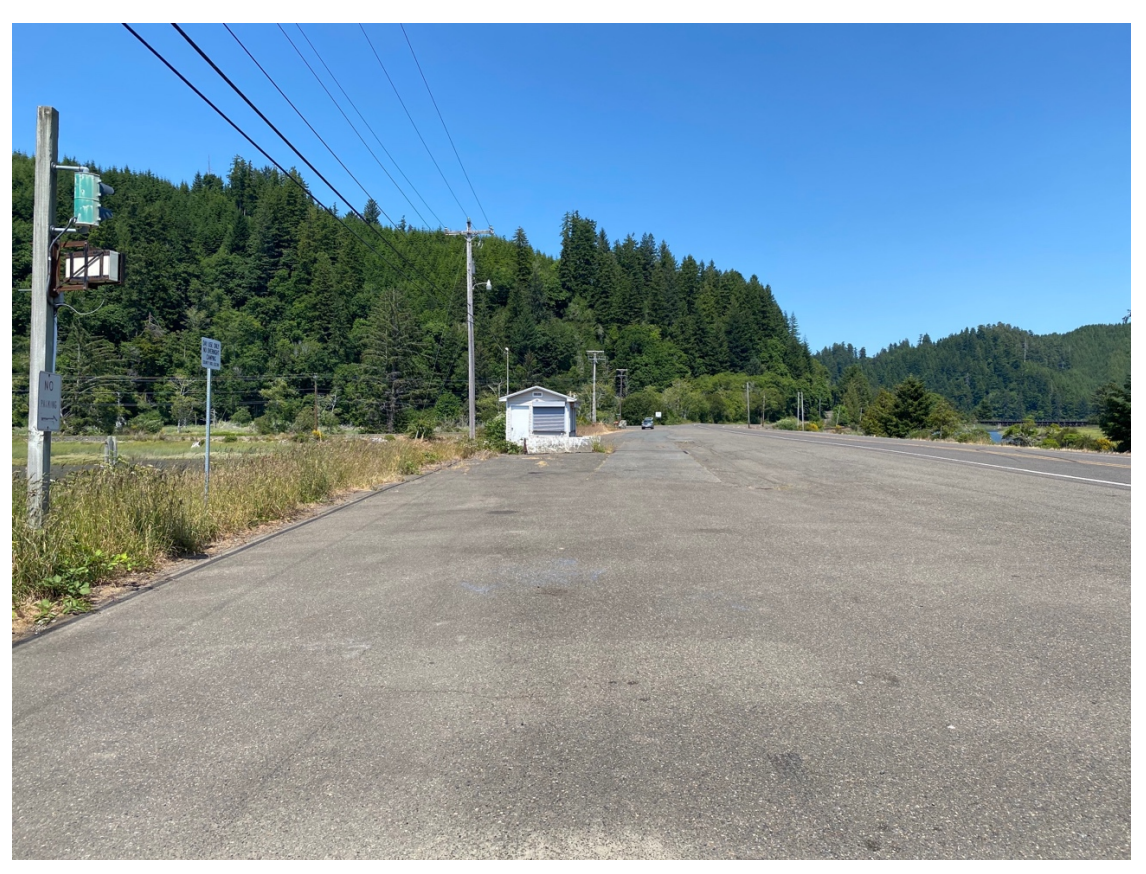
Long-distance view of weigh station turnout, David Gould, the Umpqua Memorial stone, and David's vehicle for scale, looking north from Lower Smith River Road, Oregon, June 21, 2023.