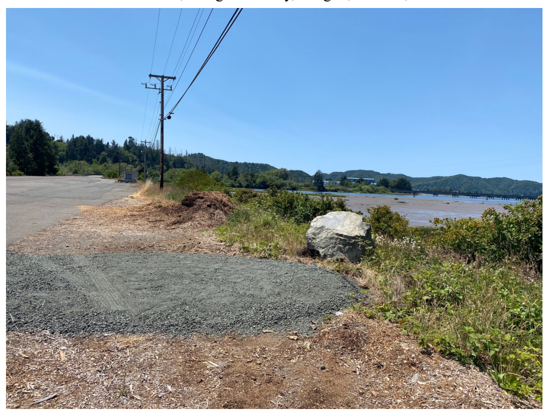
Gravel base and Umpqua Memorial stone at mouth of Smith River, Oregon, June 21, 2023.