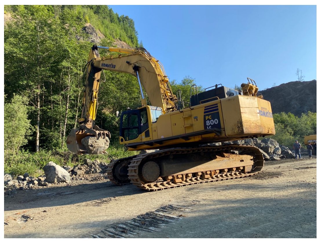
Main Rock's Komatsu PC800 excavator lifting Umpqua Memorial stone.