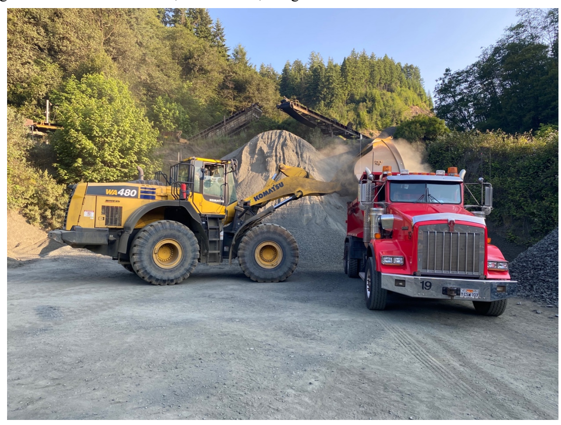
Main Rock's Komatsu WA480 loader putting bedding gravel onto Coos Bay Timber Operators dump truck for hauling with Memorial stone to Umpqua burial site.