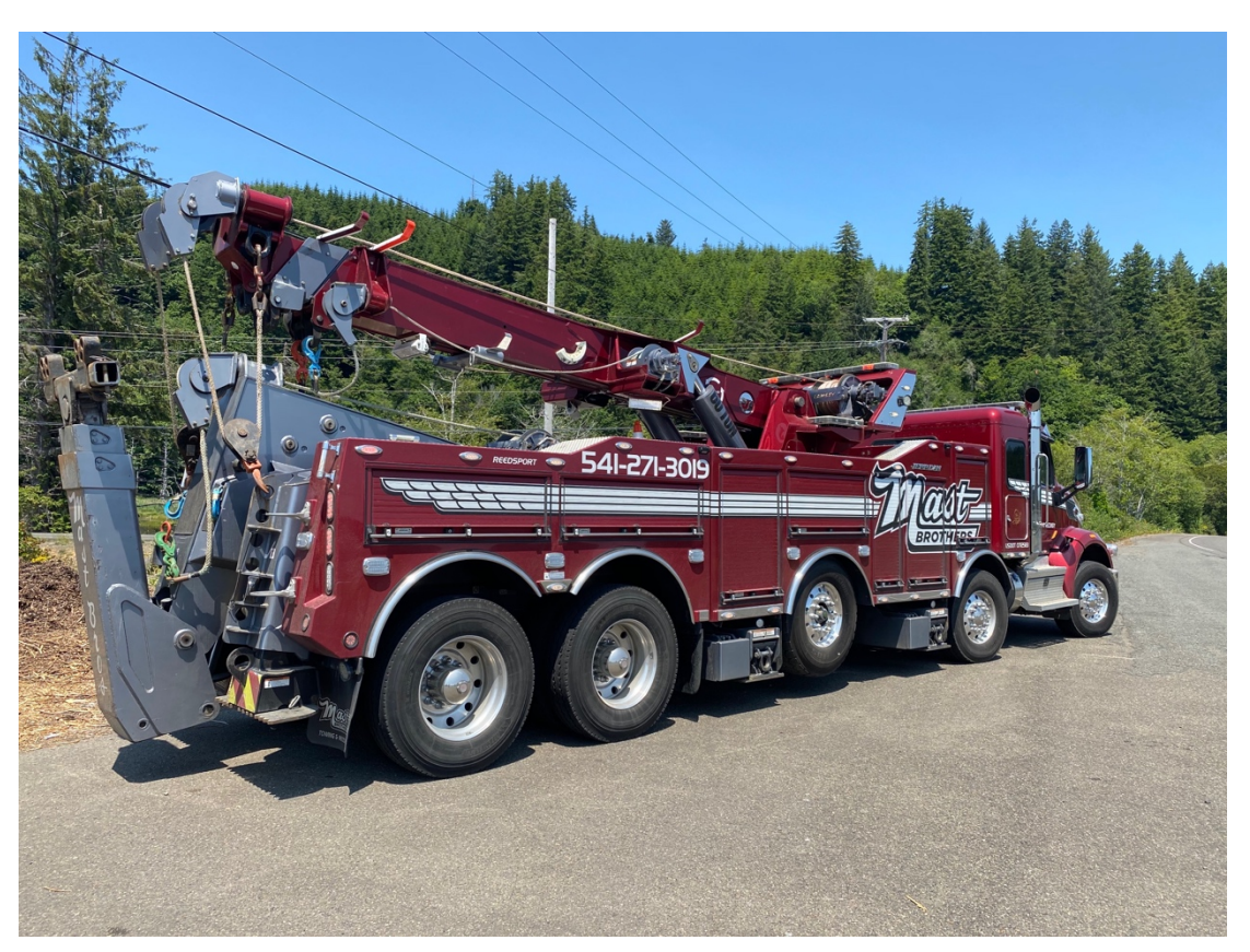
Mast Brothers donated the use of their Peterbilt heavy-duty rotator tow truck to lift and place the Umpqua Memorial stone into its permanent location at mouth of Smith River, Oregon, June 21, 2023.