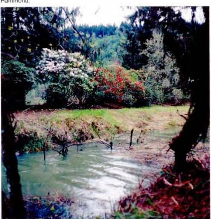
View from house area across slough showing rhododendrons, especially illustrating reflective water mentioned in text.

Portland was a special shipment sent from England to use in a major display at the Lewis & Clark Centennial Exposition held in Portland in 1905. These plants would have needed to be 10 to 15 years old to be a suitable size for the display, so the dates given on the record cards do match. After the Exposition had finished some of the plants were used to create a roadside display area by the Portland Parks department; others fell into the hands of influential private individuals. At this stage some of the foregoing requires further verification, if that is practicable; however, there is little doubt that Spruce Reach contains two of the first rhododendrons to be introduced into Oregon.