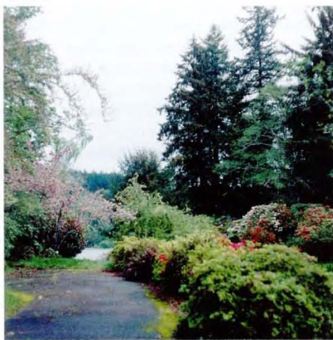
View along circle drive to Umpqua River.