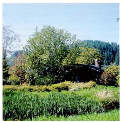
View toward house and river.

In the main garden, in the area that runs westwards from the entrance drive, alongside the ditch that parallels the highway, a number of mature large-leaved rhododendron species were planted in the early-1940s. These are likely to have been the earliest rhododendron plantings in the garden