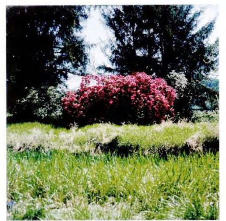
Unknown rhododendron in bloom