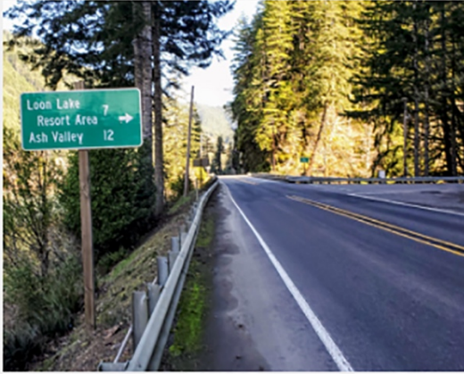
The Hwy 38 junction with Loon Lake Road