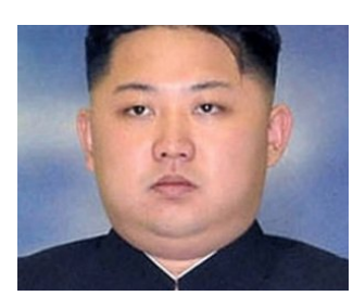
This Is What Would Happen If North Korea Launched a Real Attack